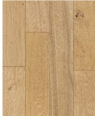
HONEY (EUROPEAN OAK) AME-TTO19007