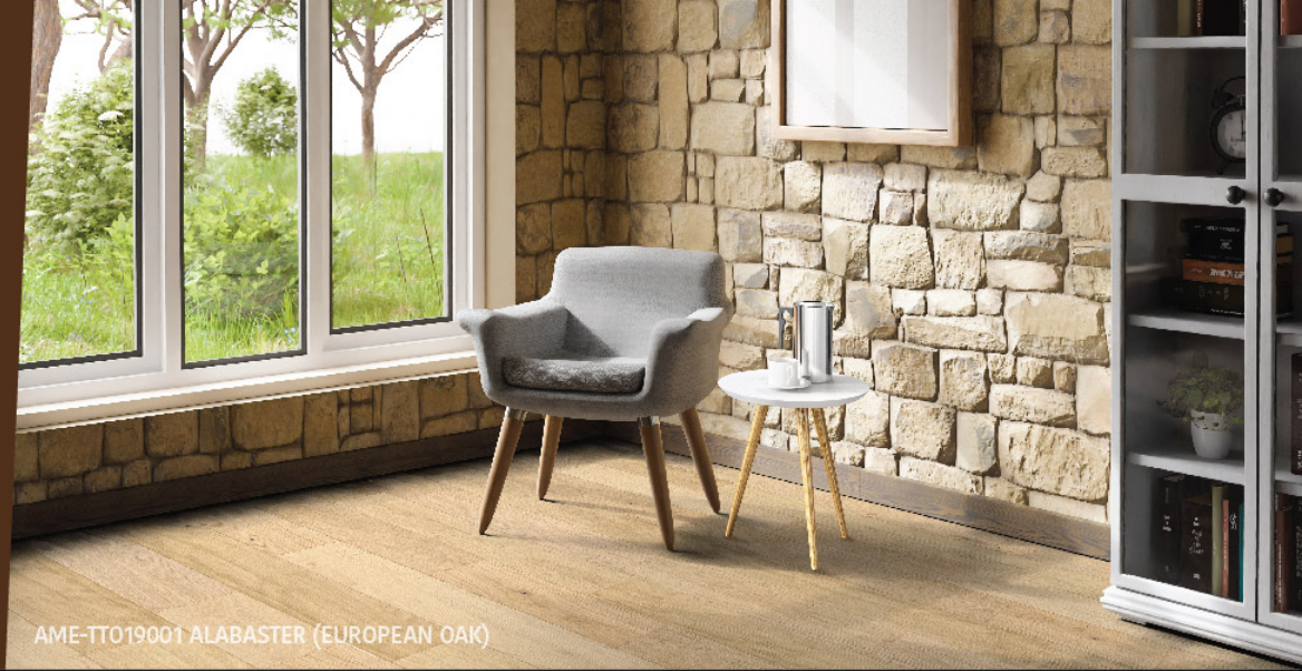
AME-TT019001 ALABASTER (EUROPEAN OAK)