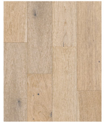
SAND (EUROPEAN OAK) AME-TTO19003