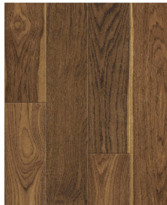
CAROB (EUROPEAN OAK) AME-TTO19010