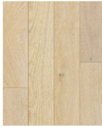
PARCHMENT (EUROPEAN OAK) AME-TTO19002