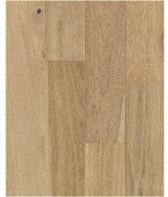
TAWNY (EUROPEAN OAK) AME-TTO19006