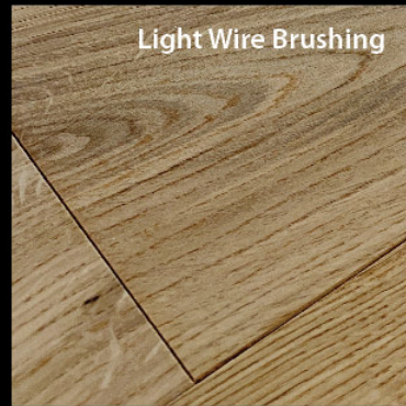
Light Wire Brushing