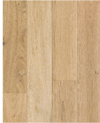
AMBER (EUROPEAN OAK) AME-TTO19005