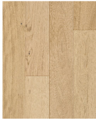
ALABASTER (EUROPEAN OAK) AME-TTO19001