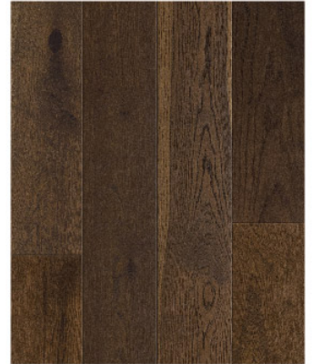
LABRADOR (EUROPEAN OAK) AME-TTO19009