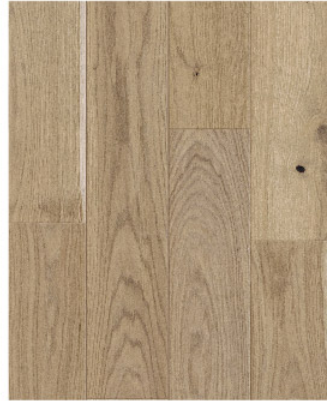
TAUPE (EUROPEAN OAK) AME-TTO19004