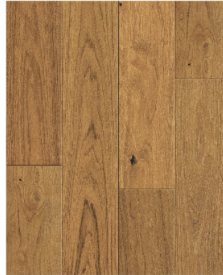
CHESTNUT (EUROPEAN OAK) AME-TTO19008