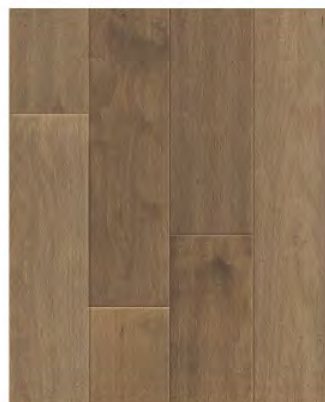
SEARSBURG (MAPLE) AME-SGMM11011