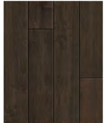
UNDERHILL (MAPLE) AME-SGMM11009