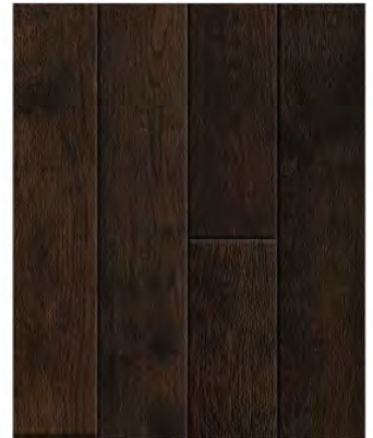
LUDLOW (OAK) AME-SGMO11006