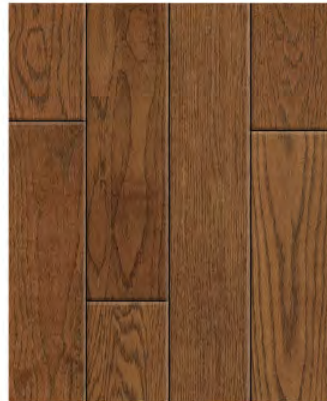
GRANBY (OAK) AME-SGMO11004