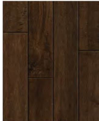
SWANTON (MAPLE) AME-SGMM11008