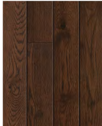
HARDWICK (OAK) AME-SGMO11005