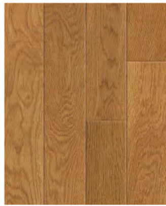
CONCORD (OAK) AME-SGMO11001