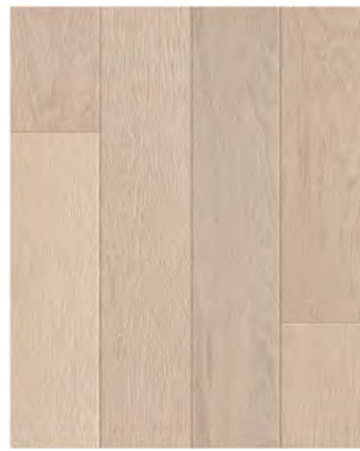
DERBY (OAK) AME-SGMO11002