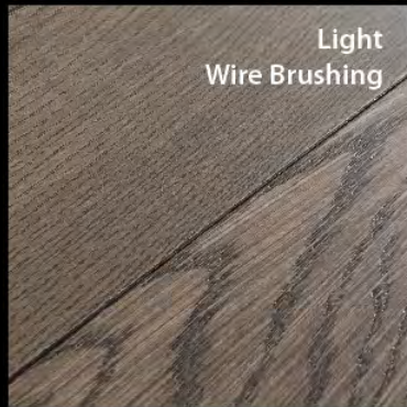
Light Wire Brushing