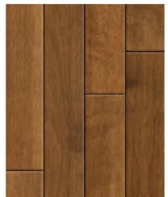
RIPTON (MAPLE) AME-SGMM11012