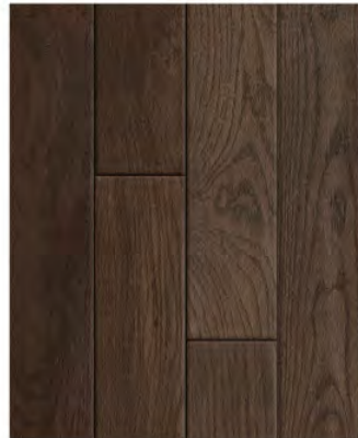
NEWBURY (OAK) AME-SGMO11007