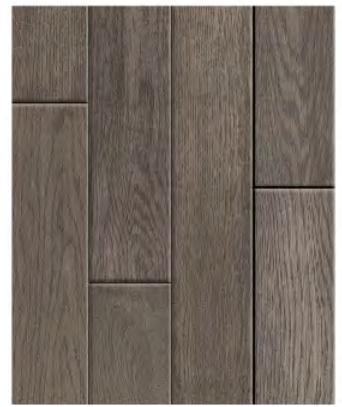
CRAFTSBURY (OAK) AME-SGMO11003