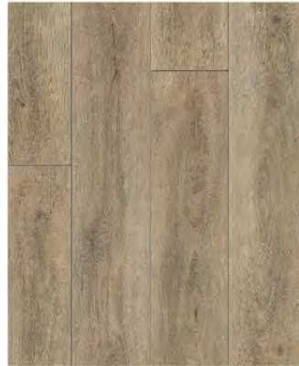
MORNING FOG SV-22304