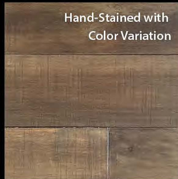
Hand-Stained with Color Variation