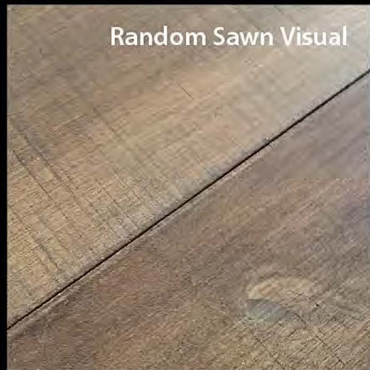
Random Sawn Visual