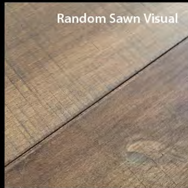
Random Sawn Visual