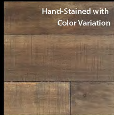
Hand-Stained with Color Variation