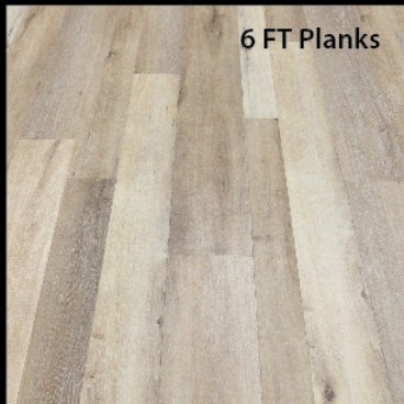
6 FT Planks