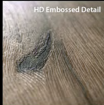
HD Embossed Detail