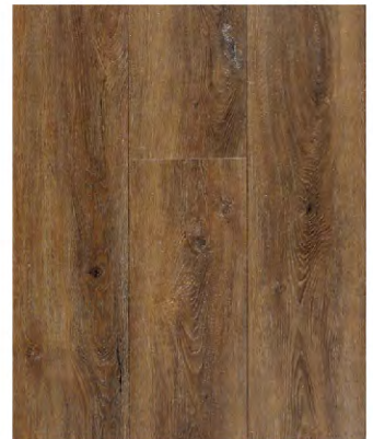
ST. MARTIN SS-P22806