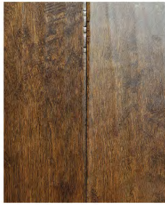
MESA (BIRCH) AME-PCB16602