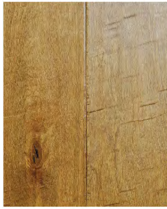
PALISADES (BIRCH) AME-PCB16601