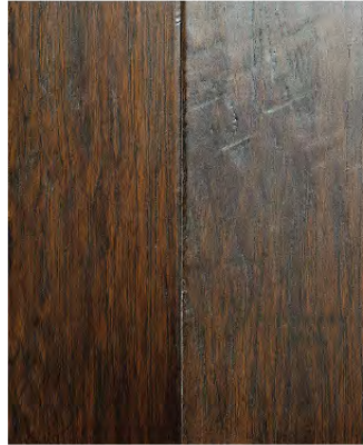
KLAMATH (HICKORY) AME-PCH16603