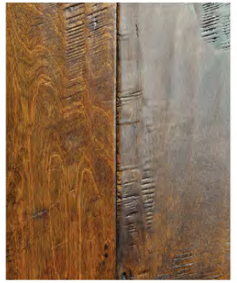
SALEM (BIRCH) AME-PCB16603