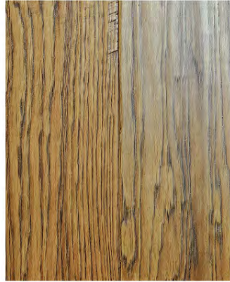
OMAK (HICKORY) AME-PCH16601