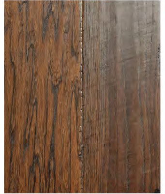
MOJAVE (HICKORY) AME-PCH16602