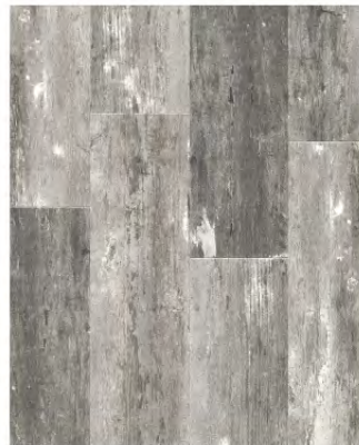
IRON HILL FM-18208