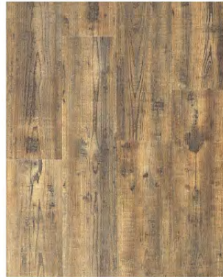
HIGH VALLEY FM-18205