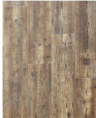
NEW HAVEN FM-18204