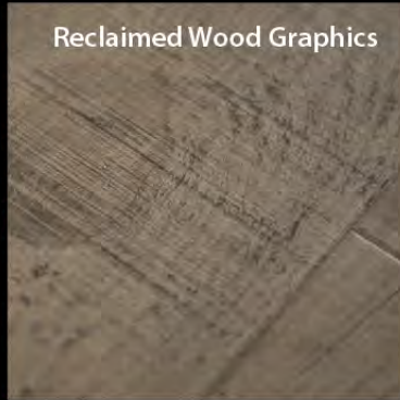
Reclaimed Wood Graphics