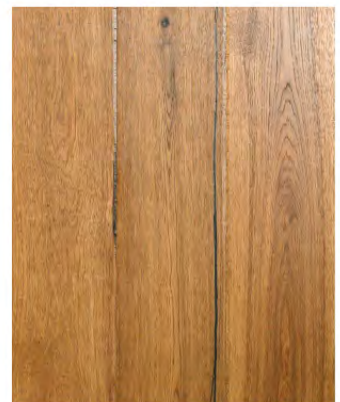
PILSNER (HICKORY) AME-ESH19003