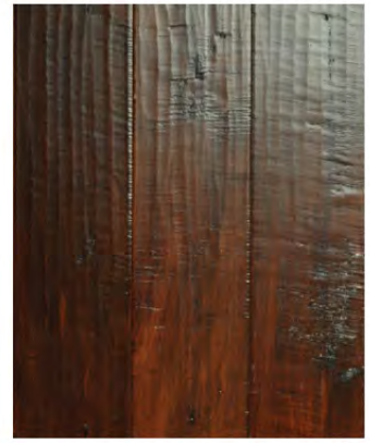
SMOKED BOURBON (MAPLE) AME-EM19001