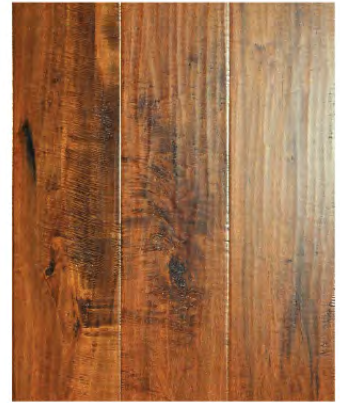
AMBER ALE (MAPLE) AME-EM19004