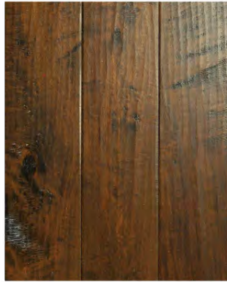
WHISKEY (MAPLE) AME-EM19002