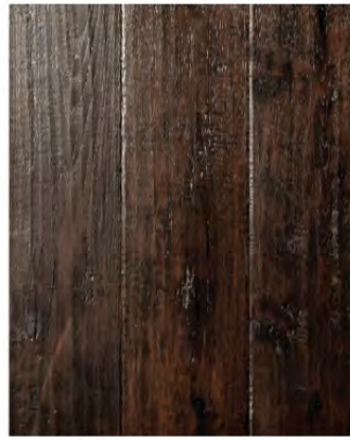
RYE (HICKORY) AME-EH19002