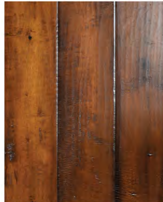
COGNAC (MAPLE) AME-EM19006