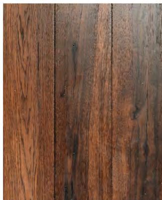
PORTER (HICKORY) AME-ESH19001