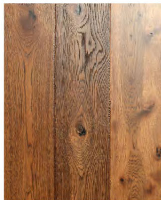
SCOTCH (HICKORY) AME-ESH19002