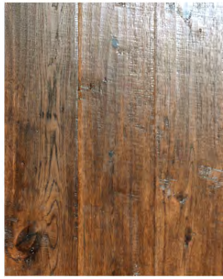
APPLEJACK (HICKORY) AME-EH19001