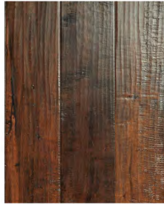
BRANDY WINE (MAPLE) AME-EM19003