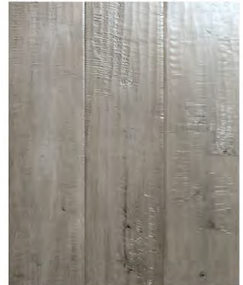
MOONSHINE (MAPLE) AME-EM19007