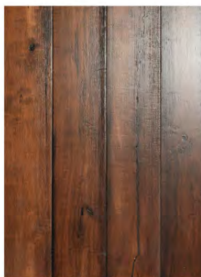
STRAWBERRY BLONDE (MAPLE) AME-AHM19005