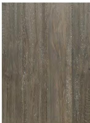
MARZEN (OAK) AME-AHO19008