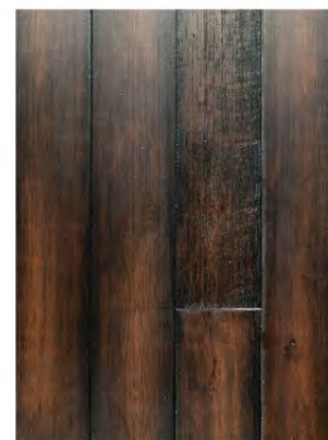
DOPPELBOCK (MAPLE) AME-AHM19006