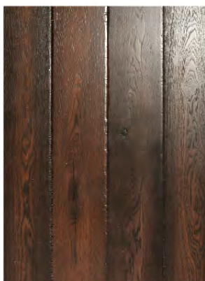
WHEAT WINE (OAK) AME-AHO19011