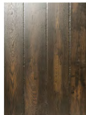
DUNKEL (OAK) AME-AHO19012