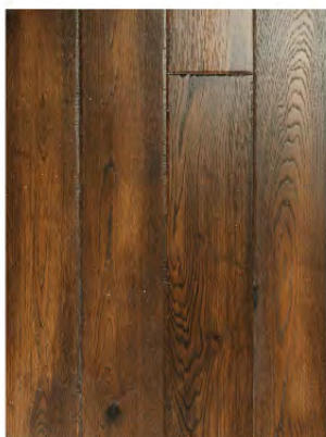
SAISON (OAK) AME-AHO19010