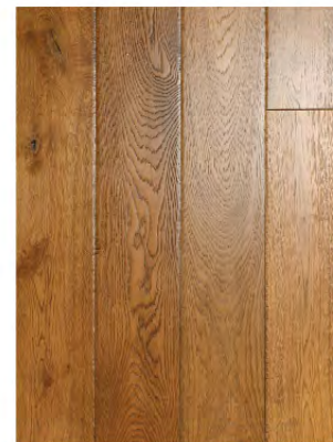
BLONDE (OAK) AME-AHO19009