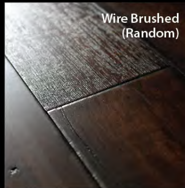
Wire Brushed (Random)