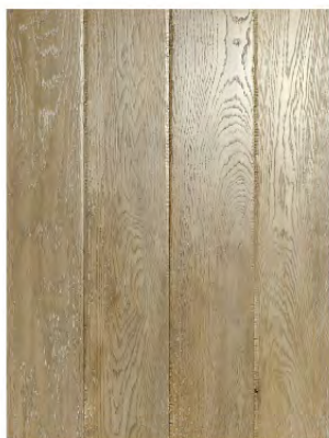
BELGIAN WHEAT (OAK) AME-AHO19007