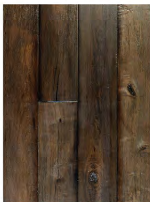
BARLEY ALE (MAPLE) AME-AHM19004