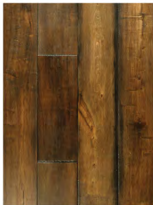
MAIBOCK (MAPLE) AME-AHM19001