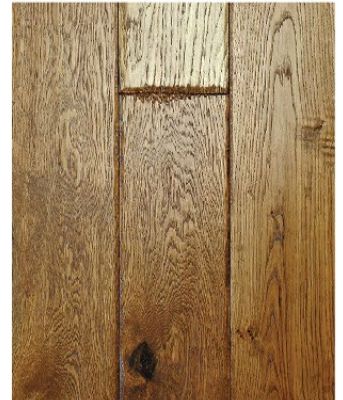
DESERT (OAK) RE-AME-S12010