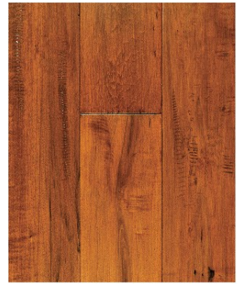
CHAMPAGNE (MAPLE) RE-AME-S12045