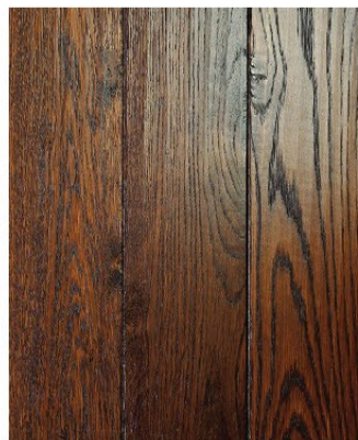
BORDEAUX (OAK) RE-AME-S12011