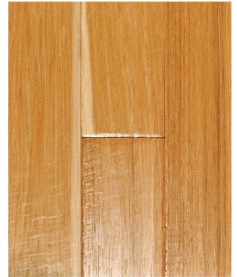
NATURAL (HICKORY) RE-AME-S12556 (W 4-7/8")