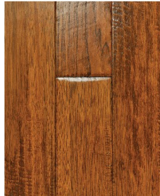
TOSCANA (HICKORY) RE-AME-S12557 (W 4-7/8")