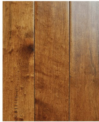
BURLAP (MAPLE) RE-AME-S12025