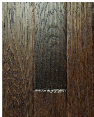
JAVA (OAK) RE-AME-S12012