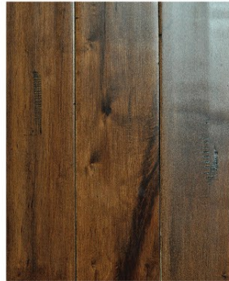
BOURBON (MAPLE) RE-AME-S12065