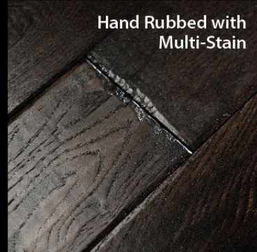
Hand Rubbed with Multi-Stain