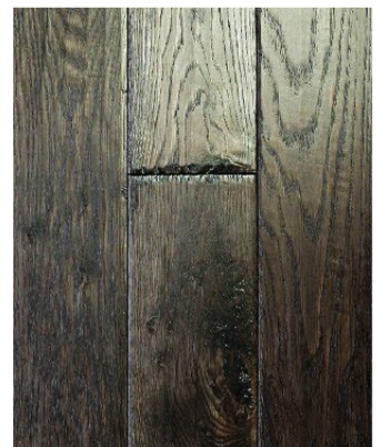
COCOA (OAK) RE-AME-S12013