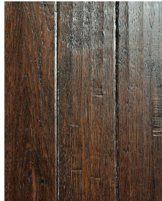
CHESTNUT (OAK) RE-AME-S12009