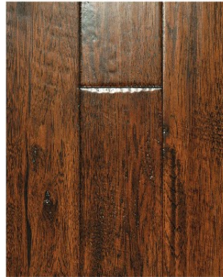
MOLASSES (HICKORY) RE-AME-S12555 (W 4-7/8")