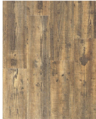
HIGH VALLEY FM-18205