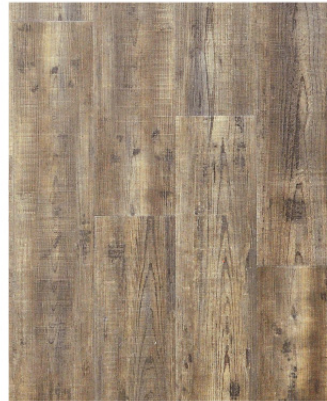
NEW HAVEN FM-18204