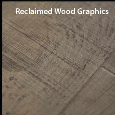
Reclaimed Wood Graphics