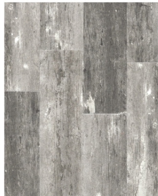
IRON HILL FM-18208