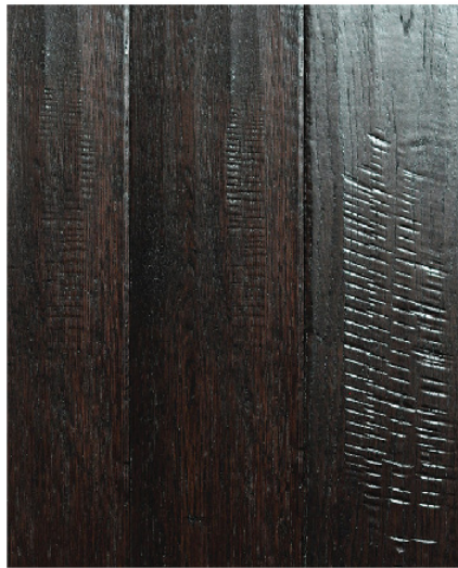
HOUSTON (OAK) JVC-TXO12703