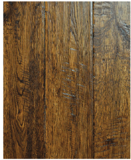
DALLAS (OAK) JVC-TXO12702