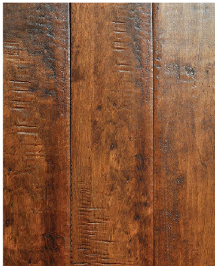
FORT WORTH (MAPLE) JVC-TXM12705