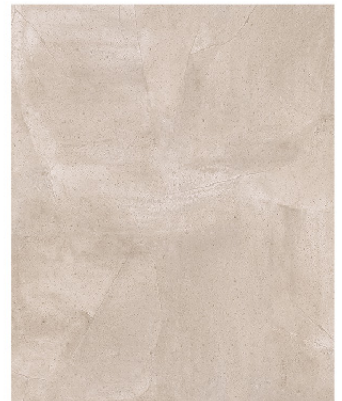
ANGUILLA (TILE) SS-T45001