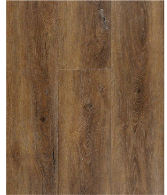
ST. MARTIN SS-P22806