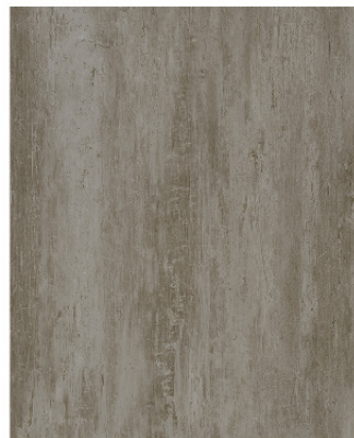
ORKNEY (TILE) SS-T45003