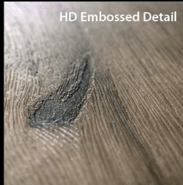
HD Embossed Detail