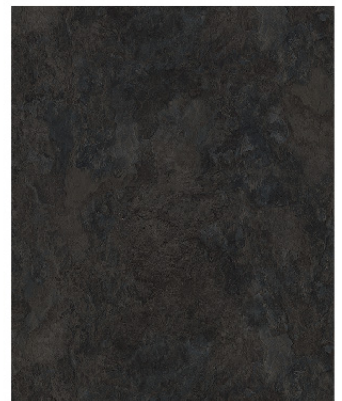
MYKONOS (TILE) SS-T45004

Johnson.hardwood www.johnsonhardwood.com