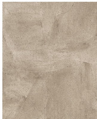
LUZON (TILE) SS-T45002