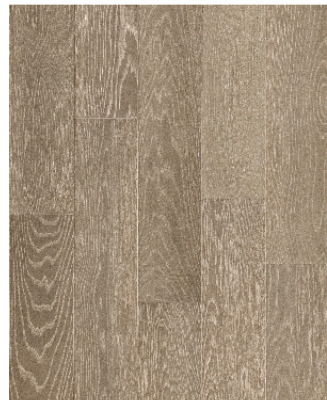
LANIER (OAK) RES-07JC