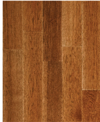
HARTWELL (HICKORY) RES-04JC