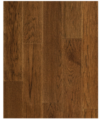
MEREDITH (HICKORY) RES-03JC