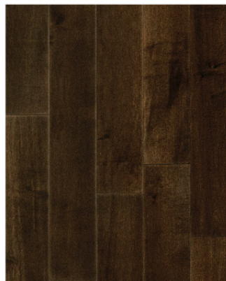
DEGRAY (MAPLE) RES-11JC

Johnson.hardwood® www.johnsonhardwood.com