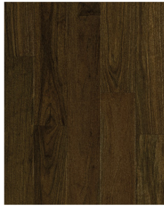
OROVILLE (WALNUT) RES-02JC