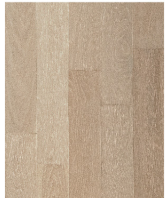
SAN LUIS (OAK) RES-09JC