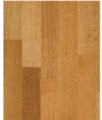
AMISTAD (OAK) RES-06JC