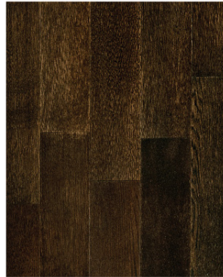
SHASTA (OAK) RES-05JC