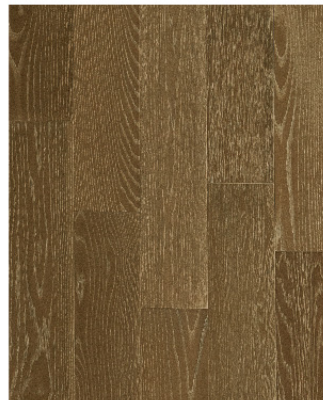
CEDAR CREEK (OAK) RES-08JC