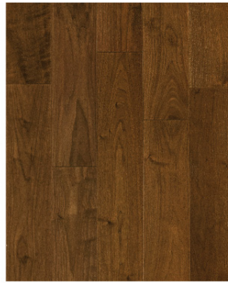
POWELL (WALNUT) RES-01JC