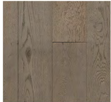
LIMERICK (EUROPEAN OAK) JH-OAK19006