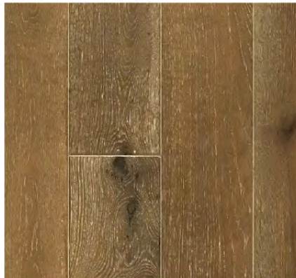
TIGER BAY (EUROPEAN OAK) JH-OAK19005