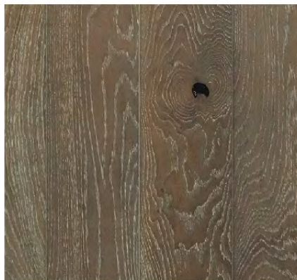
DEVON (EUROPEAN OAK) JH-OAK19007