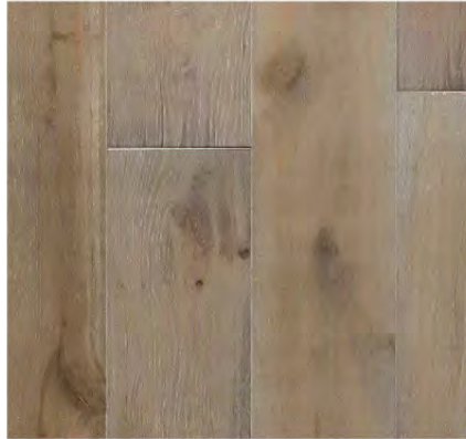
KILDARE (EUROPEAN OAK) JH-OAK19003