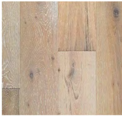
SWANSEA (EUROPEAN OAK) JH-OAK19001