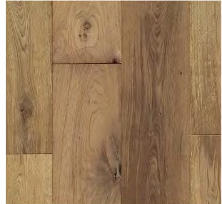
SUNDERLAND (EUROPEAN OAK) JH-OAK19004