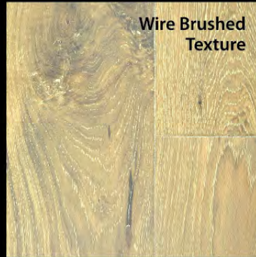
Wire Brushed Texture